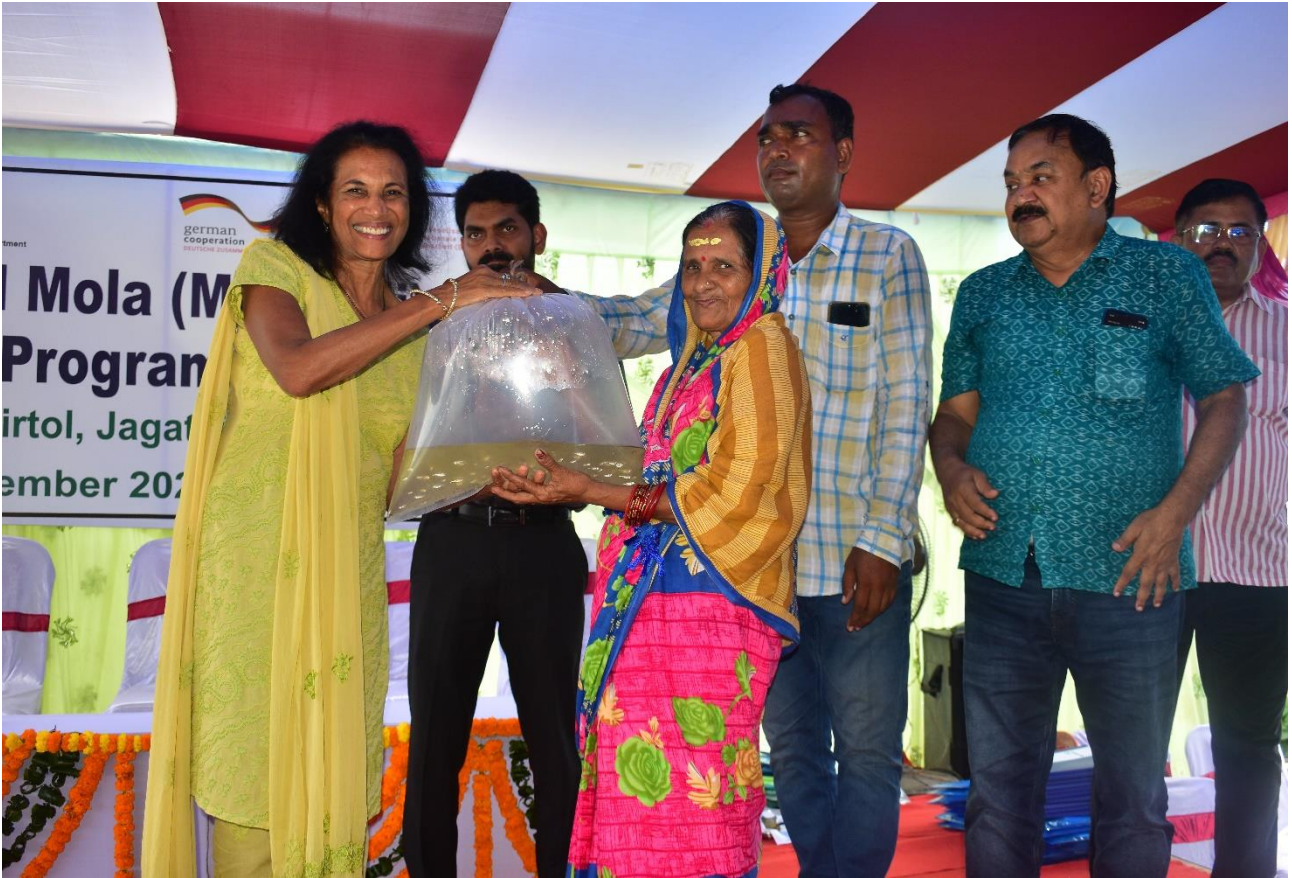
Mola seed packet distribution to a WSHG member by the dignitaries.