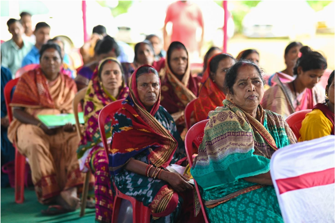
WSHG members participating in the mola seed release event.