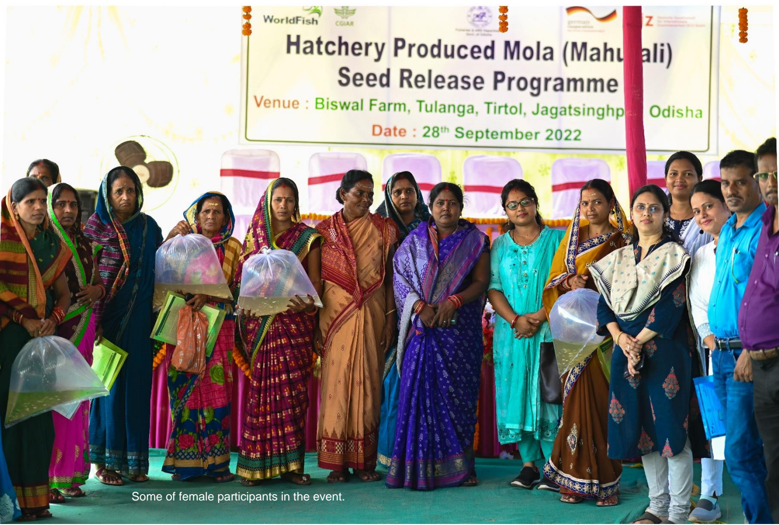
Some of female participants in the event.