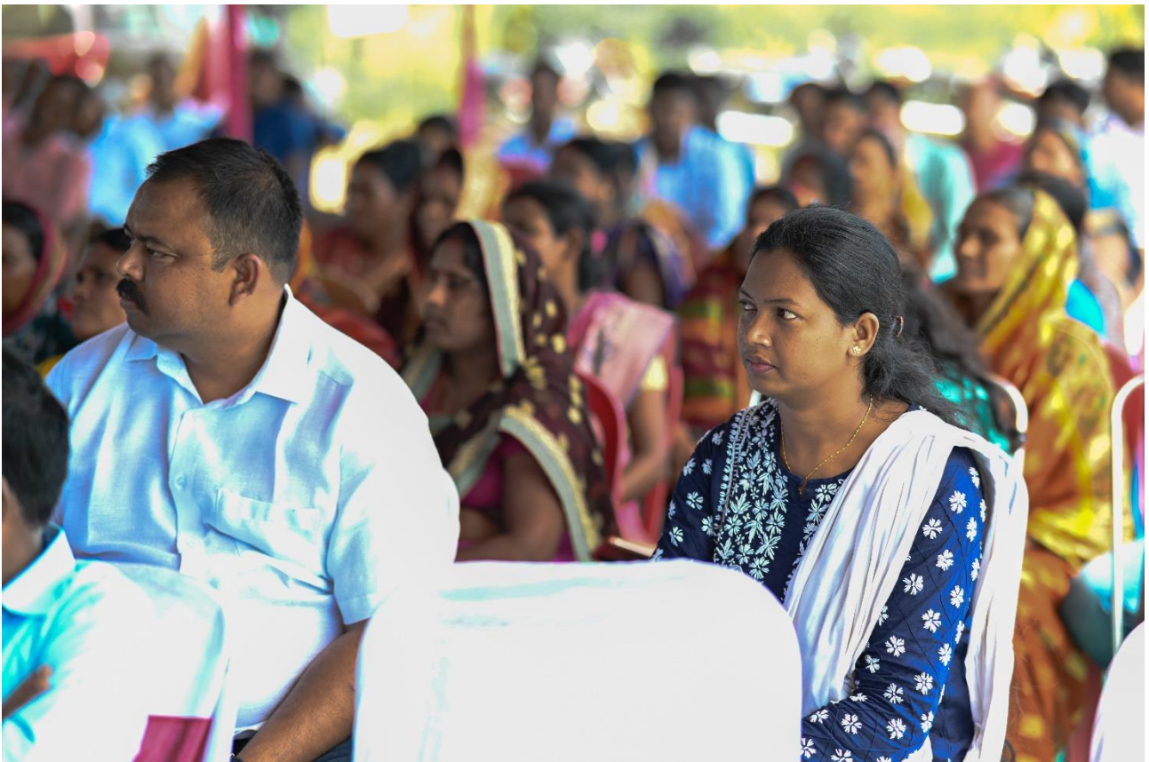
AFOs from different blocks of Jagatsinghpur district participating in the mola seed release event.