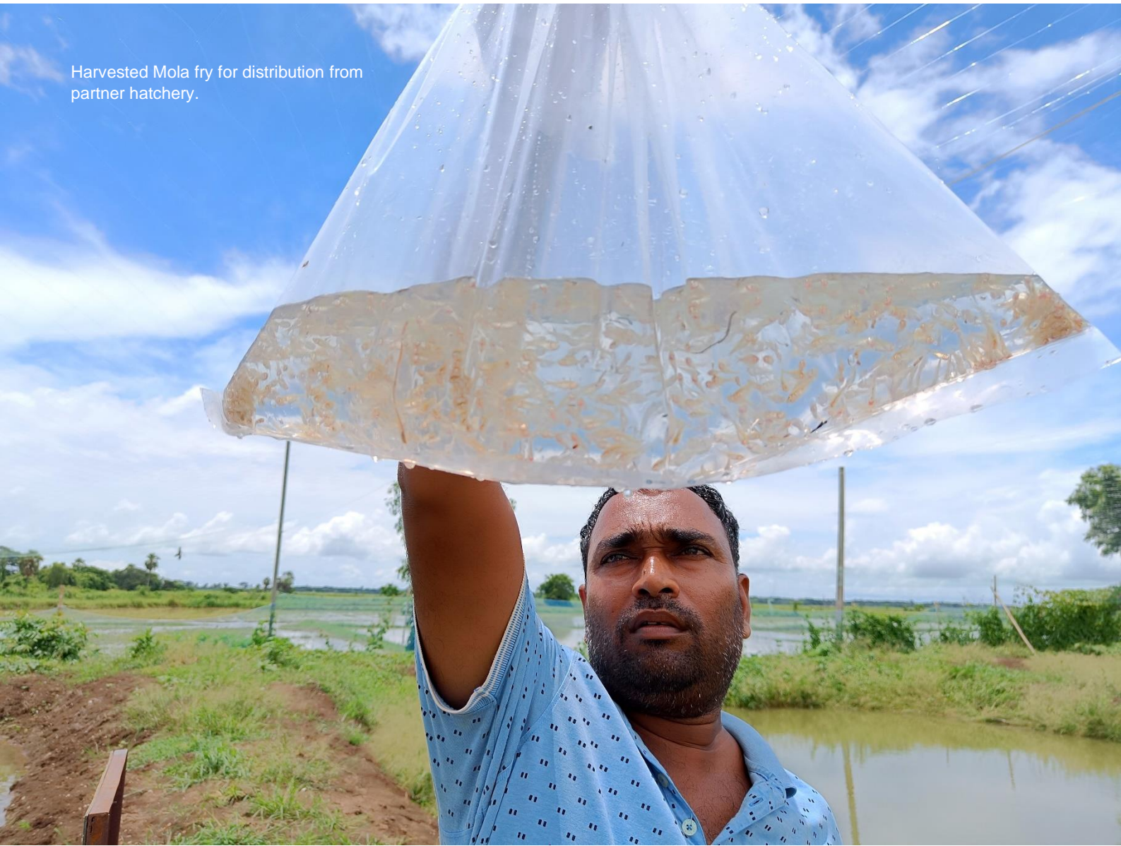
Harvested Mola fry for distribution from partner hatchery.