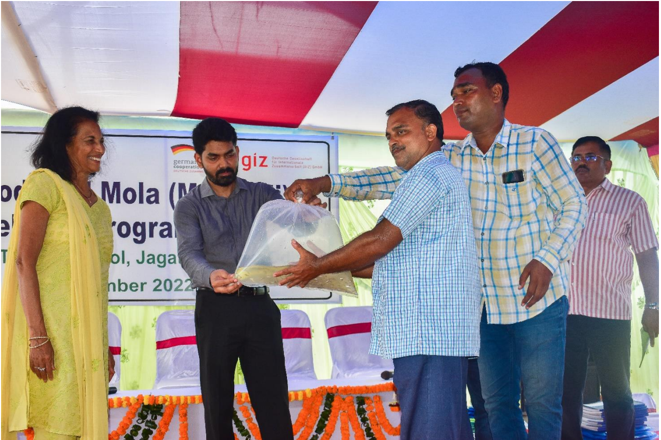
Mola seed packet distribution to a local farmer by the dignitaries.