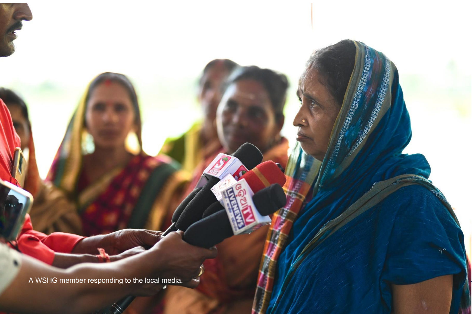
A WSHG member responding to the local media.