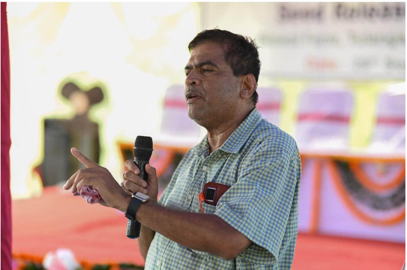
Shri Sashikant Acharya, Deputy Director of Fisheries (Reservoirs) discussing Department of Fisheries programmes.