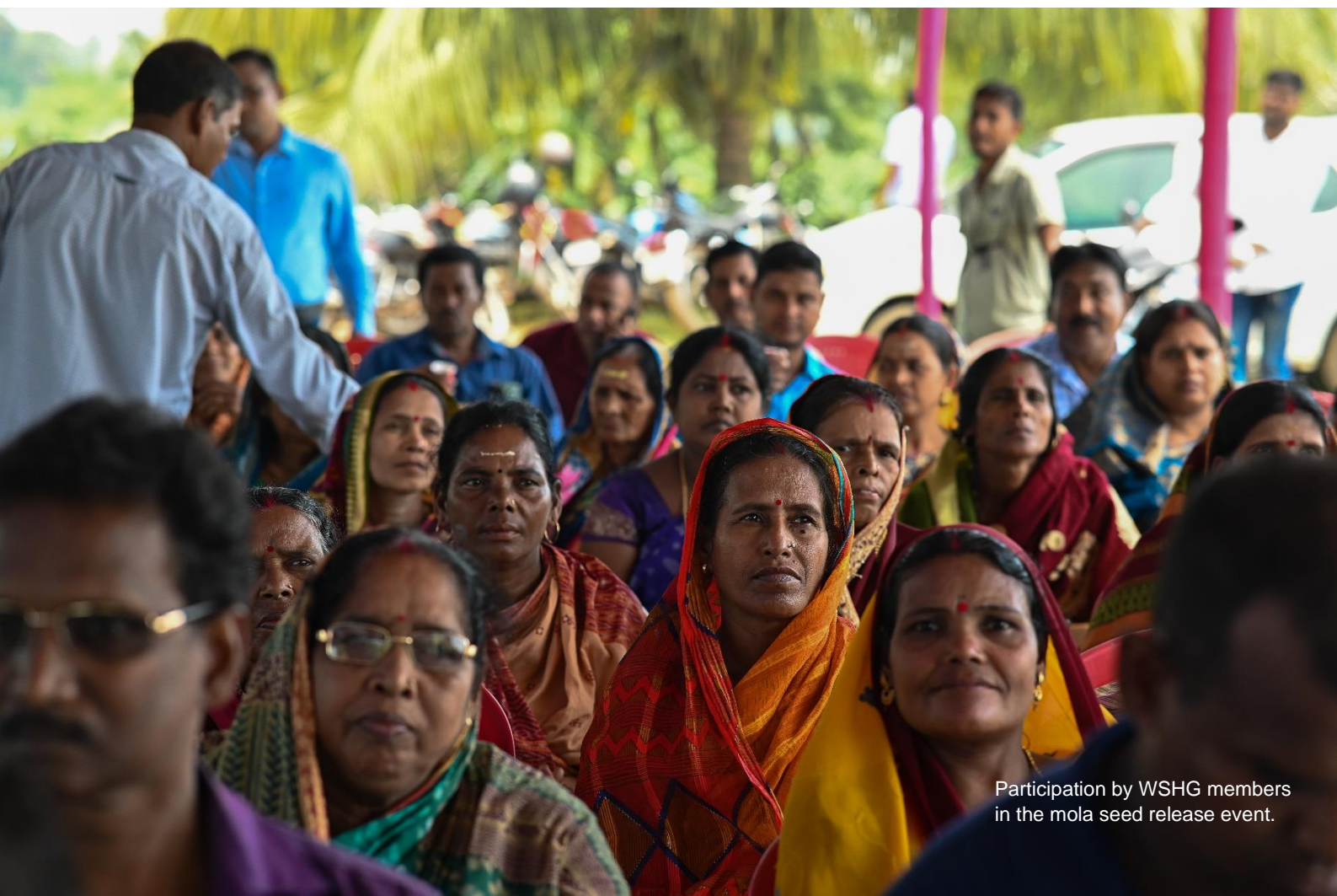
Participation by WSHG members in the mola seed release event.