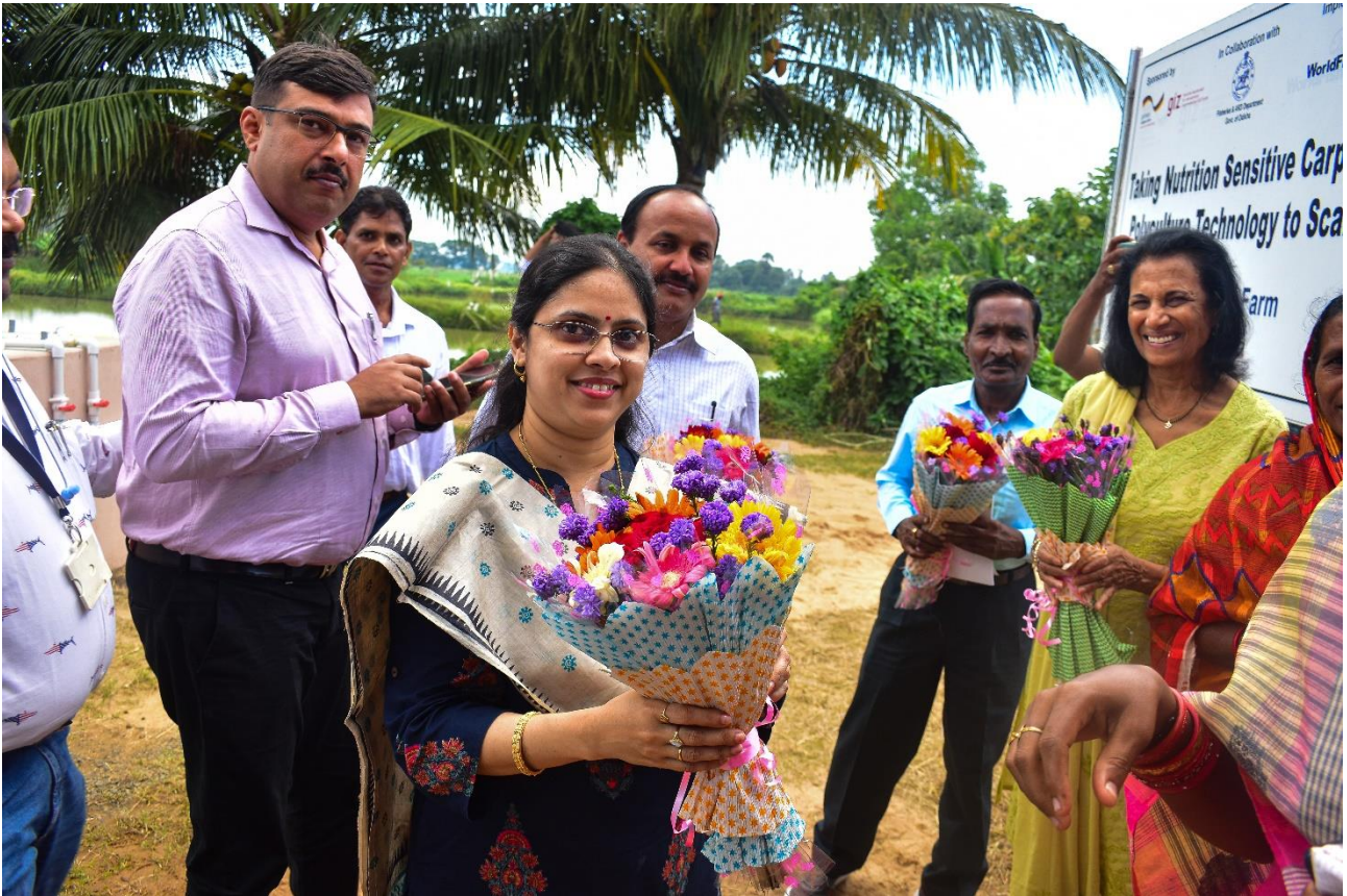
Welcoming Department of Fisheries officials and other dignitaries.